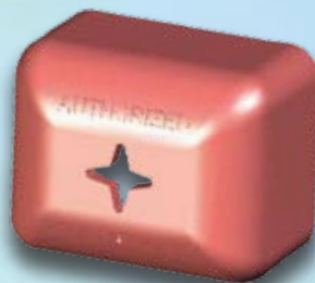
C19 Plug Shield