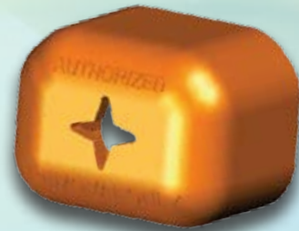
C13 Plug Shield

Manufactured under TS 16949 certification utilizing Class 101 production tooling